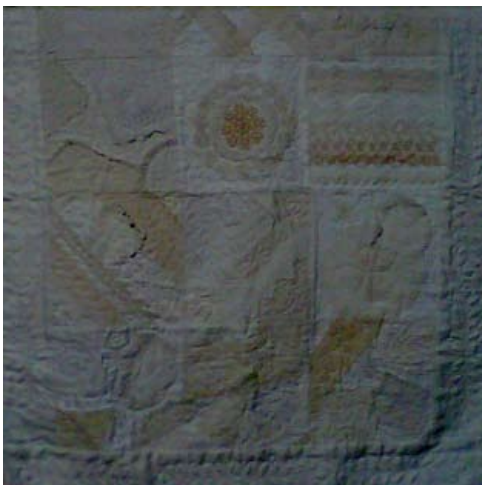
C: Whites, creams and lace crazy quilt