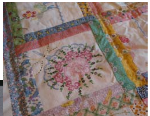
A: Embroidered Squares