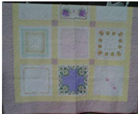
B: Hankie Quilt